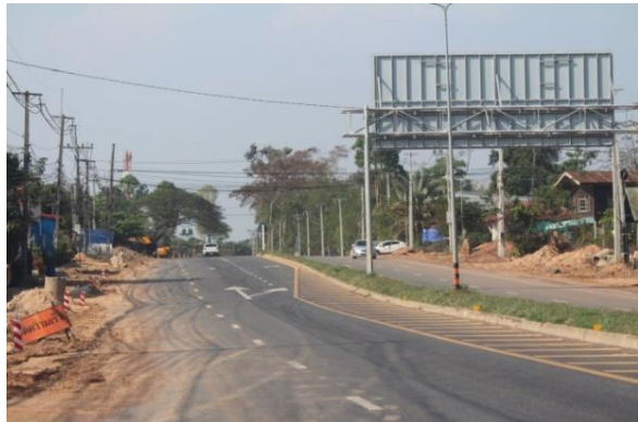
Figure 2: Route no. 212 (Ubon Ratchathani – Mukdahan – Nakhon Phanom)

That Phanom district to Nakhon Phanom province. It takes less than 40 minutes to travel.