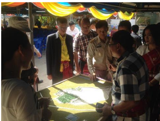
Figure 5: Exhibition and presentation with local community