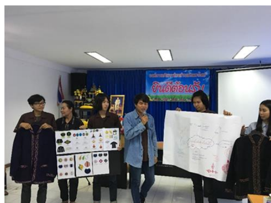
Figure 3: group discussion among students and participants from community