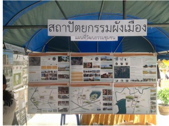
Figure 6: Exhibition and presentation with local community (continue)