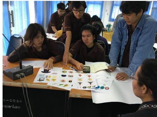
Figure 2: group discussion among students and participants from community

opportunities to make group discussions and presentation which were the fundamental step of community-university learning. Issues and possible solutions were exchanged among them.