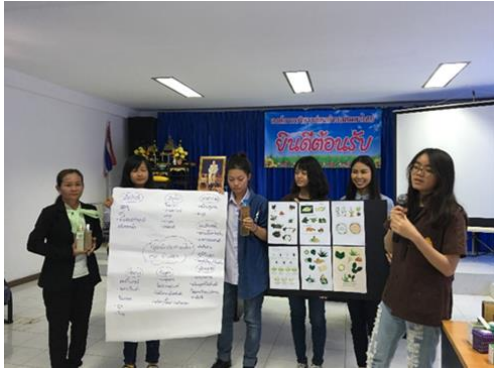
Figure 4: group presentation among students and participants from community (continue)