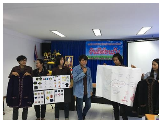
Figure 3: group discussion among students and participants from community