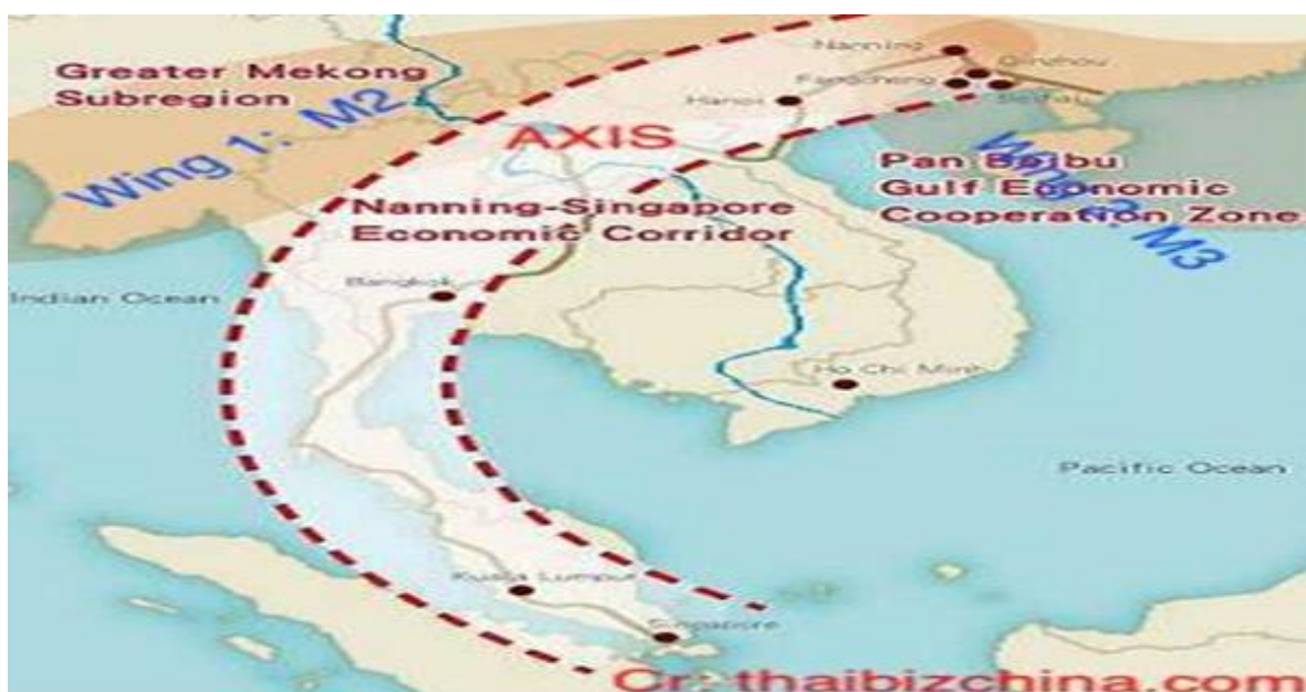
Figure 3: One Axis, Two wings strategy (small scale)

Moreover, two wings can be viewed and categorized into two sides (as Figure 4).