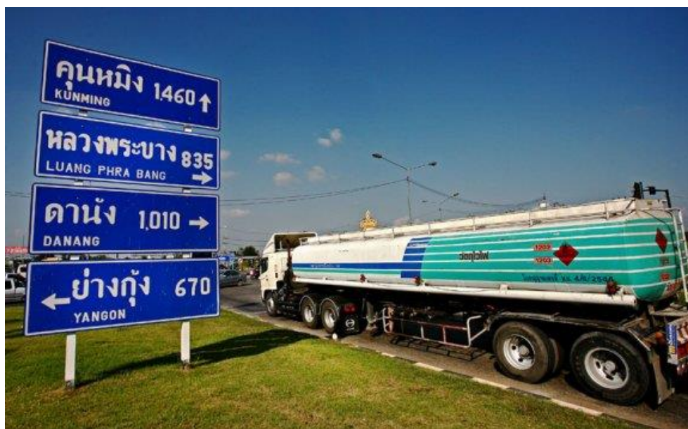
Figure 1: Indo-China Intersection

Likewise, the geographical advantage of the Phitsanulok area can be developed into a center for distribution before transporting to other parts and both sea shores. Interestingly, although this development project has been ignored and has not been continually developed for 12 years, it also directly affects the economic development strategy of the lower-northern region. Consequently, the name of this project and its signpost raise the question: “Can we really go to CLMV countries by this route?”