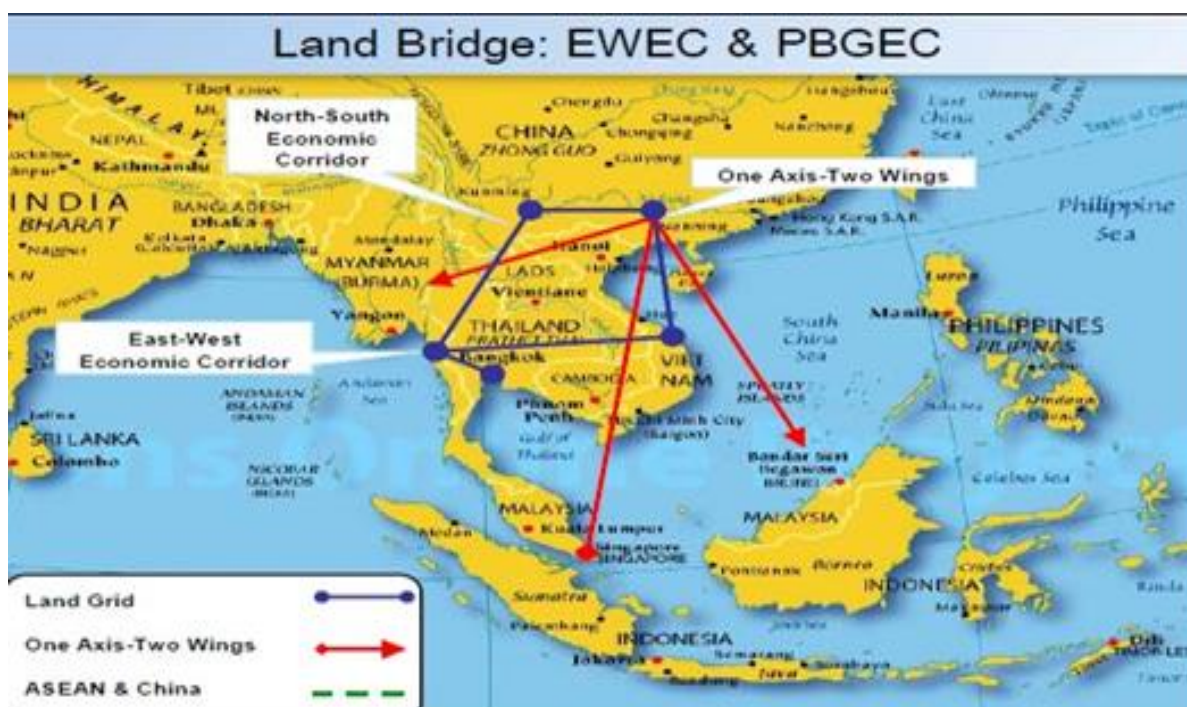
Figure 2: Strategy of Guangxi BGEZ

Other than a big scope of BGEZ, we can analyze solely on EWEC and find that the rise of EWEC through China's power is the main key factor to run this mega-project. Therefore, the superiority of Thailand is that it stays in the middle of ASEAN as the focal point of economic and political powers in this region. Also,