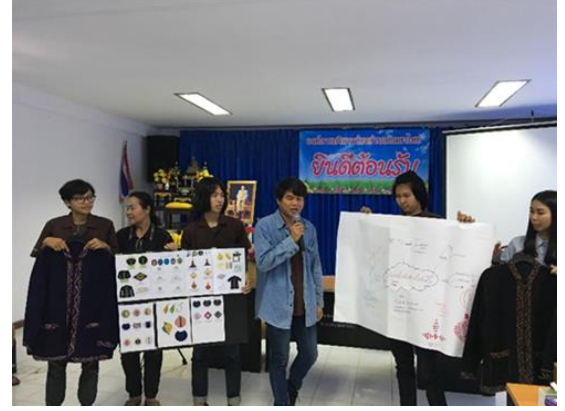
Figure 3: group discussion among students and participants from community