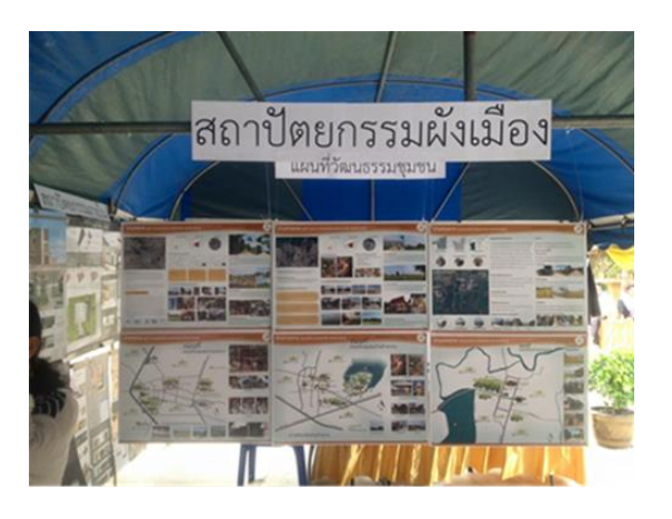
Figure 6: Exhibition and presentation with local community (continue)