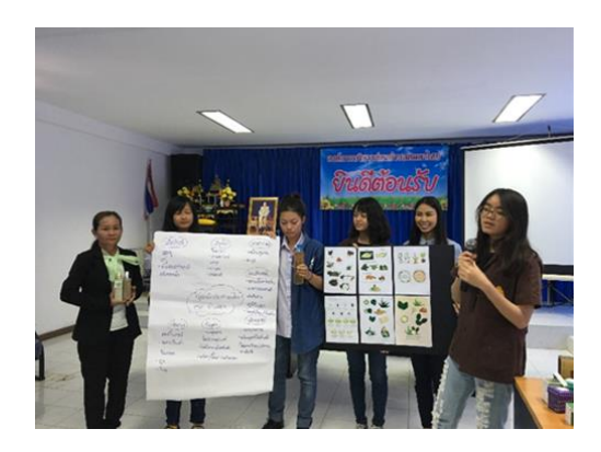
Figure 4: group presentation among students and participants from community (continue)