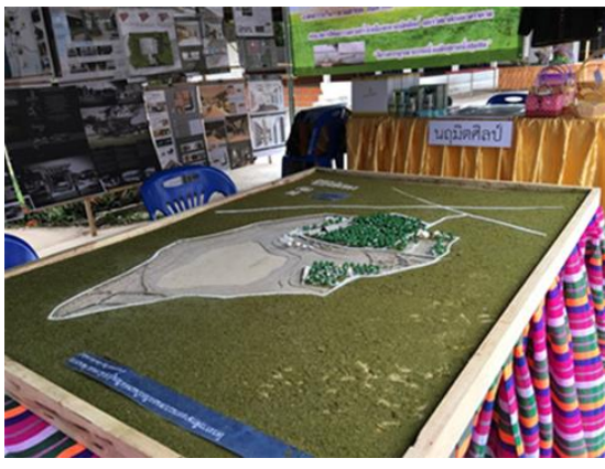
Figure 7: Exhibition and presentation with local community (continue)