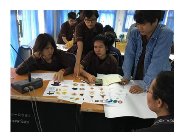
Figure 2: group discussion among students and participants from community

opportunities to make group discussions and presentation which were the fundamental step of community-university learning. Issues and possible solutions were exchanged among them.