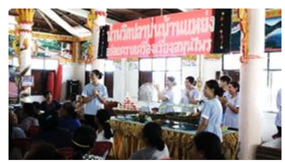
Figure 3: Ban Yang Elder Health Fairs