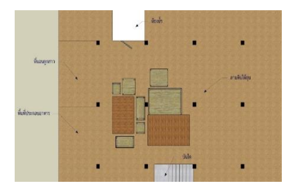
Figure 4: Example of toilet and house design