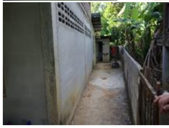
Figure 6: toilet and house after remodeling