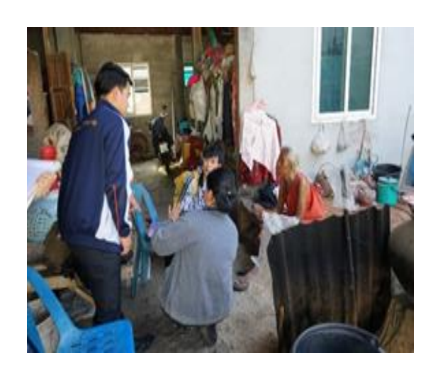
Figure 2: Prachakhom activity