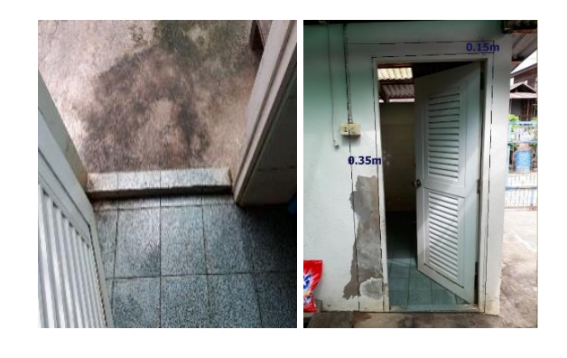
Figure 5: toilet and house before remodeling