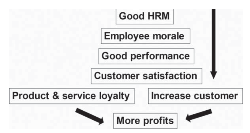
Figure 1 HR Generates Long-Term Profit for the Organization

good performance, customers will be satisfied and impressed; those customers will be loyal customers of the organization and will forward that impression to other customers, which increases more customers in the organization. This is a way to generate long-term profits for the organization. As shown in Figure 1.